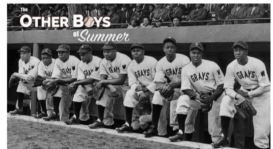
"The Other Boys of Summer"

In January, Shipman & Goodwin was the lead sponsor of the New York City premiere of "The Other Boys of Summer," a documentary film exploring civil rights through the stories and lives of the Negro League Baseball Players. Several members of the firm attended the event which featured a moving, entertaining, and inspirational documentary about this important part of American civil rights history.